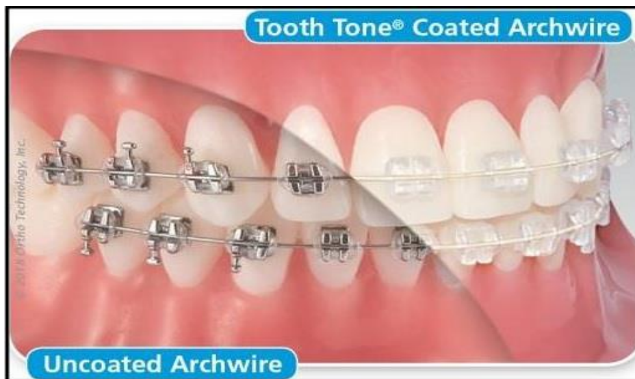
Figure 2: Comparison between coated and uncoated archwires (Orthotechnology product catalogue, 2021).

The aesthetic component of orthodontic appliances has been considered to be important for patients seeking orthodontic treatment, hence numerous attempts have been made to construct various aesthetic archwires and aesthetic brackets (Kim et al., 2014). To coat stainless steel or nickel titanium wires, manufacturers frequently utilize numerous types of coating materials, including Teflon, Epoxy, polymer, and rhodium materials (Ryu et al., 2015) (Figure 2). Rhodium enhances aesthetics when used as a coating material for standard orthodontic arch wires because of its silvery-white glossy look and friction-reducing properties (Katic et al., 2015), and shows non-significant color change after immersion in the biofresh mouthwash (Al-joubori et al., 2023). The mechanical and frictional characteristics of arch wires may be impacted by the presence of a coating layer (Washington, 2014; Choi et al., 2015). As a result, manufacturers frequently attempt to cover wires with materials that have excellent aesthetic and frictional properties (Elayyan, 2010). Previous research found that measured wire dimensions frequently differed from those stated by the manufacturer, and that frictional forces were significantly influenced by wire size and coating thickness, with frictional forces being higher in labially coated wires due to increased wire size and coating thickness and lower in fully coated wires due to reduced total dimensions and thin coating thickness (Abbas and Alhuwaizi, 2018).