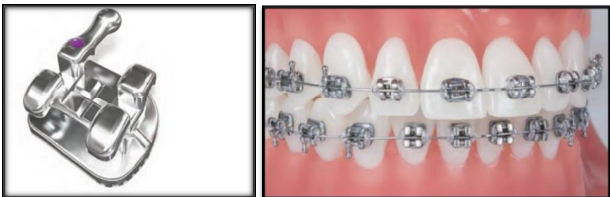
Figure 3: Stainless steel brackets (Ortho Technology Product Catalog, 2018).

Material for the brackets When compared to other brackets, stainless steel brackets have the lowest coefficient of friction (figure3) (Proffit et al., 2019). Cobalt chromium brackets generate significantly more frictional resistance than titanium brackets when using titanium-molybdenum and stainless steel archwires, and more friction than stainless steel brackets with stainless steel archwires (Nair , Padmanabhan and Janardhanam, 2012). Even when using the same archwire material, titanium brackets produce more friction than SS ones, which was explained by the material's surface roughness and coefficient of friction (Husain and Kumar, 2011).