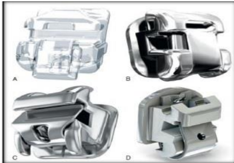
Figure 5: Different designs of self ligating brackets (Proffit et al., 2019).