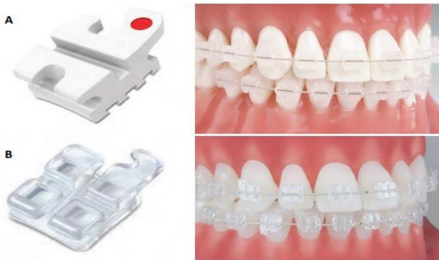
Figure 4: A: Polycrystalline ceramic brackets. B: Monocrystalline ceramic brackets (Ortho Technology Product Catalog, 2018).

Because there is a greater desire for aesthetics in dentistry, orthodontic companies have been working to develop brackets made of new materials that are more aesthetically pleasing than SS. Ceramic brackets are typically constructed of aluminum oxide. These brackets are classified into two types: monocrystalline alumina brackets (sapphire) and polycrystalline alumina brackets (ceramic) (Figure 4). Sapphire brackets are generally milled directly from one sapphire crystal using diamond tools. To ensure that the particles are fused, the polycrystalline alumina tends to bind thermally (Kusy, 1988; Elekdag-Türk and Yilmaz, 2018). The color stability of the esthetic materials used is regarded as the most important aspect of successful esthetic treatment. When using sapphire orthodontic brackets, the patient's cooperation and habits need to be taken into account. Additionally, patients should be instructed to consume limit-staining beverages (Hassan and Ghaib, 2020). Polycrystalline ceramics have a rough surface and create high resistance to sliding than monocrystalline ceramic and stainless steel, which are comparable (Russell, 2005).