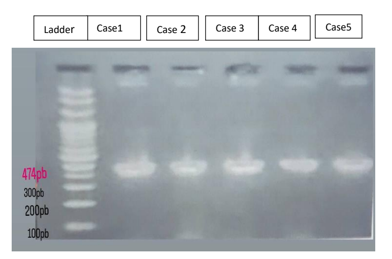
Fig.(2)Electrorelay of C.pneumonia products (474bp) on acarose gel at a concentration of 2% and dye with ethidium bromide dye 0.5 microns with a voltage difference of 90 volts for (45-30) minutes.

Fig. (1) Electrorelay of C.trachomatis products (300bp) on acarose gel at a concentration of 2% and dye with ethidium bromide dye 0.5 microns with a voltage difference of 90 volts for (45-30) minutes.